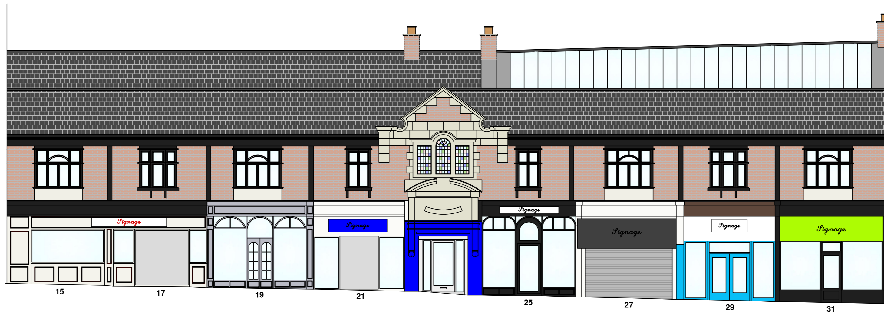
EXISTING ELEVATION TO CHAPEL WALK