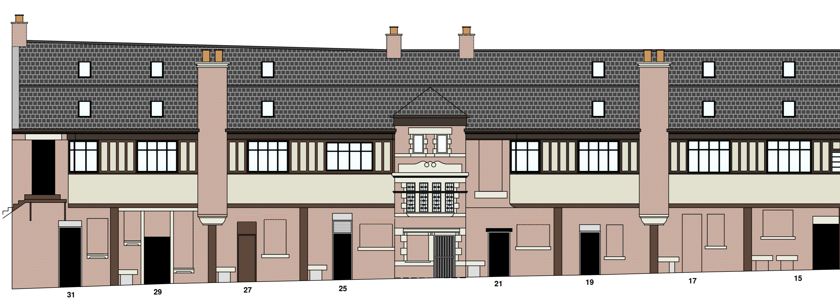
PROPOSED ELEVATION TO BLACK SWAN WALK