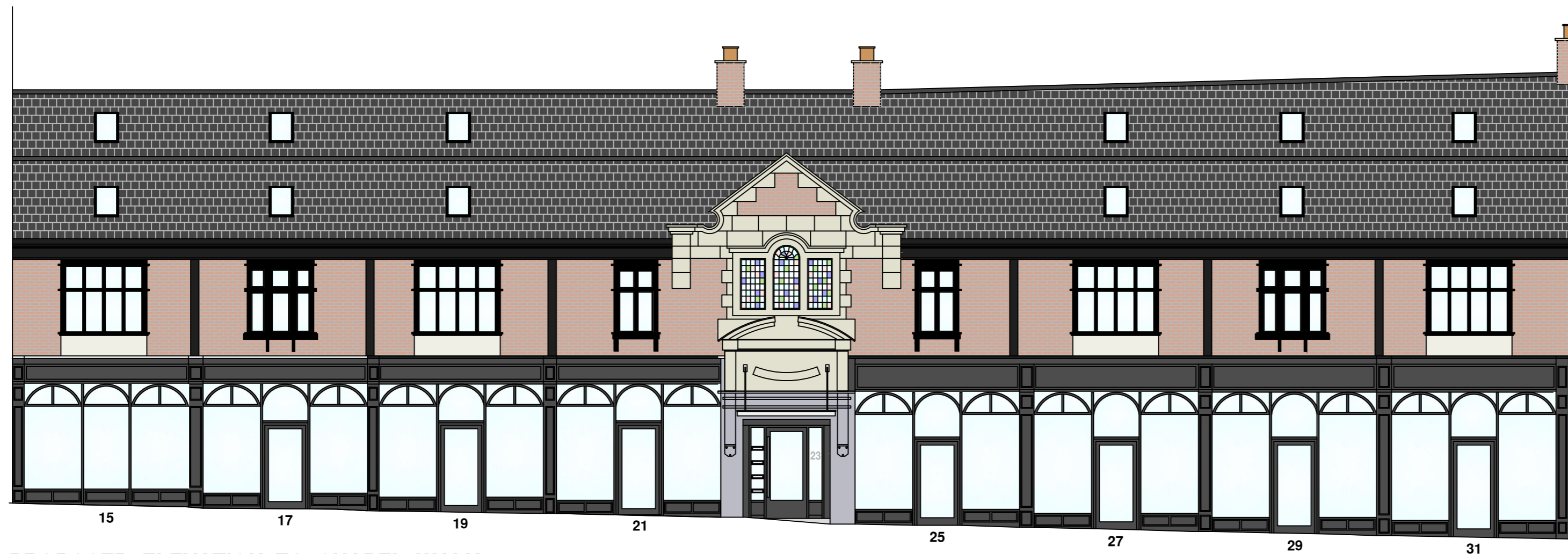
PROPOSED ELEVATION TO CHAPEL WALK