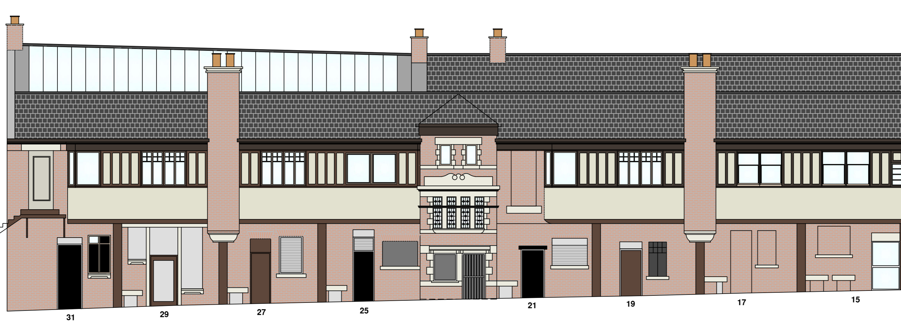
EXISTING ELEVATION TO BLACK SWAN WALK